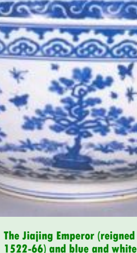
The Jiajing Emperor (reigned 1522-66) and blue and white