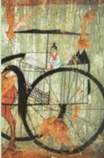
Han dynasty tomb mural