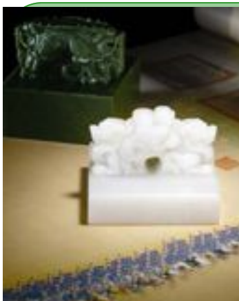
Qianlong Imperial Seals from the Estate of Émile Guimet and Emperor Qianlong's Review of the Grand Parade of Troops