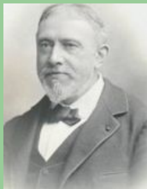
Émile Guimet (1836-1918)