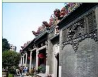
Chen Clan Academy