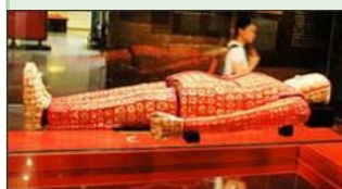
Mausoleum of the King of Nanyue