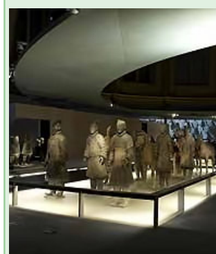
The British Museum Reading Room transformed for The First Emperor exhibition