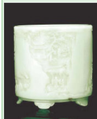
White jade cylindrical brushpot, Qianlong period (1736-1795)