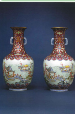
A pair of vases with famille rose decoration, formerly No. 443 of the JP Morgan (1836-1913) Collection, now in the Huaihaitang Collection