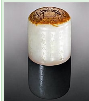
White jade Imperial seal, 1796

about the astonishing scope of the First Emperor's legacy. She also discussed the wide-reaching education programmes accompanying the exhibition and the hope that Eurocentric people, as a result of The First Emperor exhibition, would see Qin Shihuangdi as a man of astonishing vision and in the company of other luminaries such as Alexander the Great.