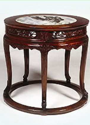
Five-legged high waist round ji table in huanghuali and dalishi marble