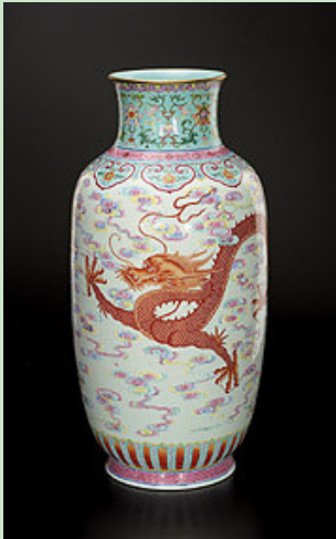
Vase with dragon design in iron-red and famille rose