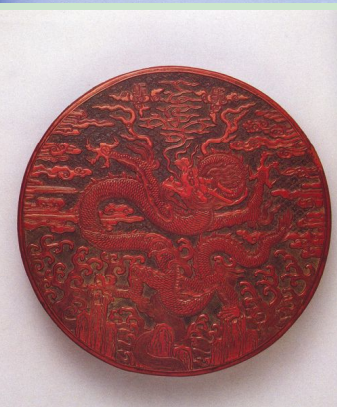
Porcelains and lacquer with auspicious word designs