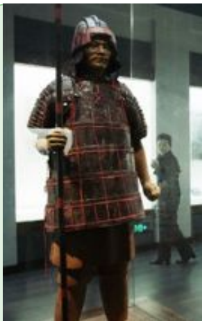
Lacquer armour, Hubei Provincial Museum gallery

The museum's many galleries include those focusing on: Qujialing— Prehistoric culture in the Middle reaches of the Yangtze River; the Panlongcheng site in Huangpi with its bronze civilization; Bamboo Slips of the Warring States Period, the Qin Dynasty and the Han Dynasty; Lacquered Articles in the Qin and Han Dynasties; Jiuliandun—a large tomb of a Chu Noble