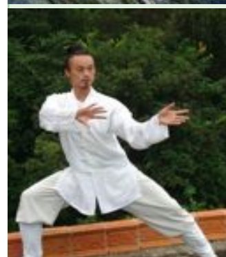
The pinnacle of Wudang Mountain, where the "Golden Hall" is located; martial arts demonstration